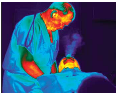
Figure 1: Visualization of nitrous oxide ( N_2O ) from the patient's breathing zone in a dental operator.

To visualize possible WAGs in the recovery room, the identical instrumentation used in the JADA February 2009 issue was utilized. (See figure 1) Preliminary data were collected using three types of instrumentation. These were Infrared thermogra-