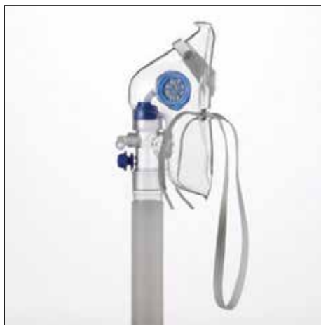
The ISO-Gard® Mask with ClearAir™ Technology (Teleflex, Durham, NC)

phy by means of an infrared camera (Merlin Mid-INSB Midwave infrared camera), digital videography by means of a camcorder (Handicam, DCR-SR100, Sony, Tokyo), and a real-time nitrous oxide air concentration levels by means of an infrared spectrophotometer (Miran 1B SapphIRE Ambient Air Analyzer). 61