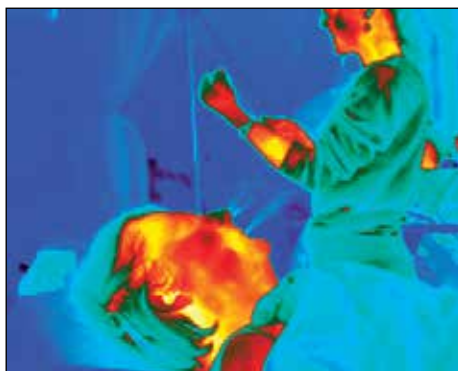
Figure 2: Visualization of WAG ( N_2O ) escaping from the nose and mouth of a patient in a PACU.

The Sony camcorder was then used to videotape the MIRAN unit readings that were displayed on its screen. Thus, confirmation both visually and with the MIRAN visual readout was accomplished to determine the nitrous oxide levels following the completion of the surgical procedure. The preliminary findings were consistent with