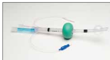
Figure 2. Rusch Easy Tube (Teleflex Medical)

Indirect laryngoscopy is useful for patients with a limited mouth opening or