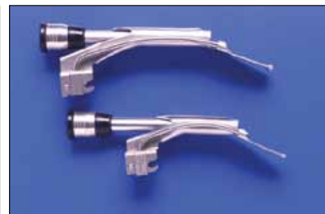
Figure 2. ViewMax (Teleflex Medical)

The LMA is an alternative airway device used for anesthesia and airway support. It consists of an inflatable silicone mask and rubber connecting tube. This device was the first supraglottic airway that became regularly used in clinical practice. It is a useful device because it allows rapid airway access for spontaneous or controlled ventilation and does not re-